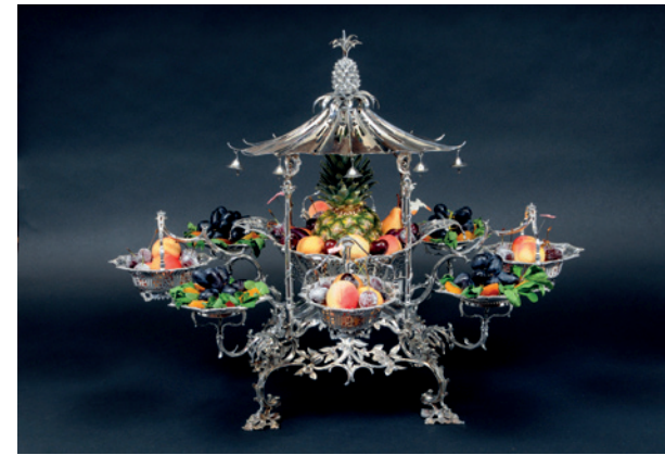
Recent Acquisition: Thomas Pitts Silver Epergne 1759